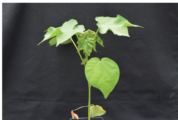
Fig. 17. Upright petioles and blistered young leaves with low rate.