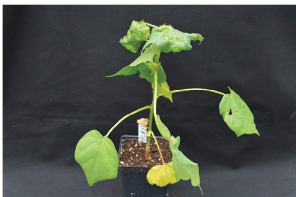
Fig. 26. Blisters developing along leaf veins.