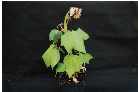
Fig. 30. Chlorosis and abortion of apical meristem.