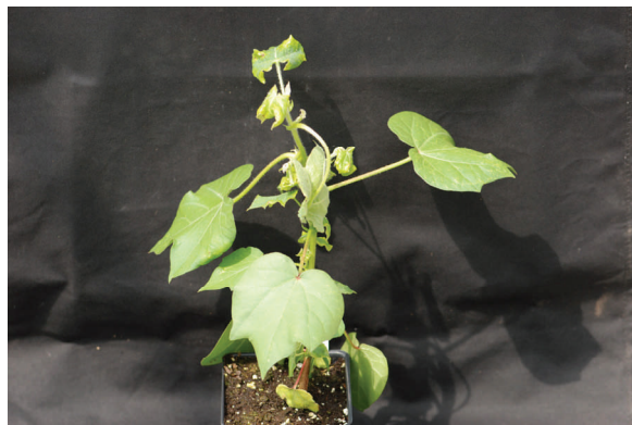
Fig. 15. Severe petiole epinasty.