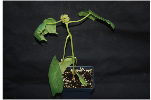
Fig. 9. Early signs of chlorosis and blistering.