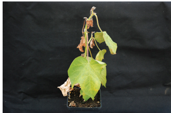
Fig. 12. Browning and chlorosis.