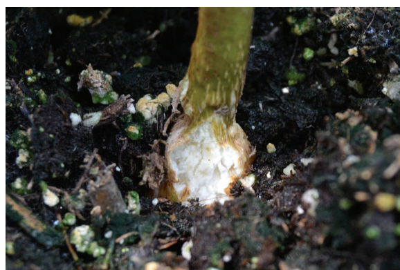
Fig. 29. Swelling and rupturing of stem at base.