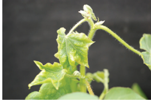
Fig. 11. Reduced apical growth.