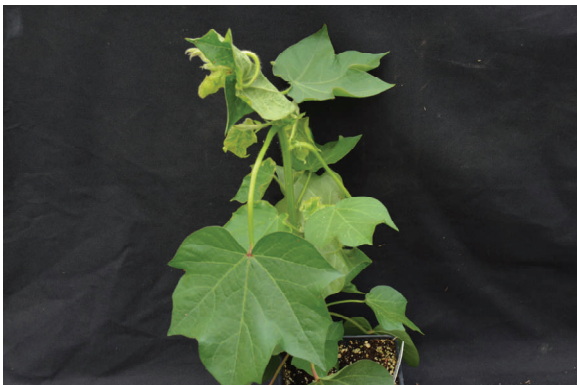
Fig. 8. More severe petiole drooping and leaf curling.