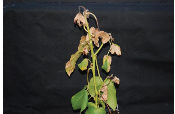
Fig. 6. Browning of leaves and abortion of meristem.