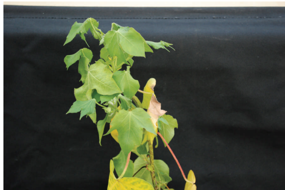
Fig. 24. Chlorosis in older leaves and strapping in younger leaves.