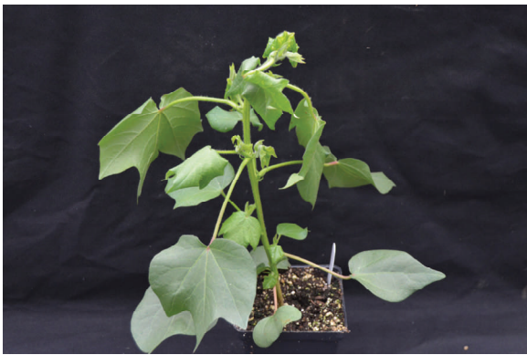
Fig. 1. Drooping of petioles and curling in new leaves.

Plants exposed to picloram typically exhibit symptoms relatively soon, with leaf petioles drooping by three days after treatment. The upper stem is epinastic and newer leaves are folded downwards, nearly vertical. New leaf margins are curled downwards as well (Fig. 1). As early as five days after exposure, new leaves are blistered in appearance. By one week after treatment, most petioles are bent downwards, nearly vertical (Fig. 2). Most of the older leaves are curled downwards at the margins and the new leaves are bunched. By 10 days after exposure, leaves show signs of chlorosis (Fig. 3) and the newest buds are browning (Fig. 4). At higher rates, the stem is swollen and ruptured around two weeks after exposure (Fig. 5). By one month after exposure, nearly half the plant is necrotic (Fig. 6). Because picloram use rates are higher than aminocyclopyrachlor or aminopyralid, drift damage to cotton will often appear sooner and more pronounced.