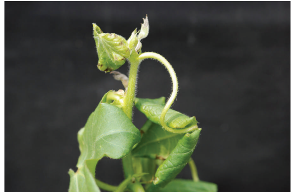
Fig. 4. Browning of new leaf buds.