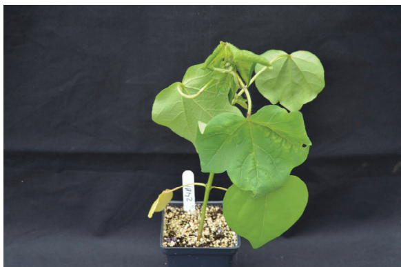
Fig. 20. Petioles twisting and young leaves curled at margins.