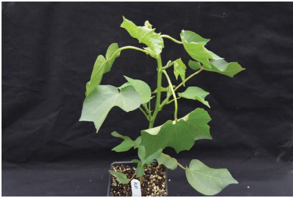
Fig. 7. Petioles drooping.

Around three days after treatment, most petioles are drooping at or below horizontal. (Fig. 7). Leaves are also curled upwards slightly. By one week after exposure to aminocyclopyrachlor, leaf petioles have folded down even more and new leaves are yellow and have reduced lateral expansion (Fig. 8). At 10 days after exposure, plants exposed to high rates show signs of chlorosis and blistering near leaf margins (Fig. 9). Later, blistering and chlorosis become more apparent and young leaves are cupped upwards (Fig. 10) and plants have severely reduced apical growth (Fig. 11). By six weeks after exposure, younger leaves are brown and older leaves are highly chlorotic (Fig. 12). Abortion of the apical meristem and development of necrotic symptoms are slower than with picloram.