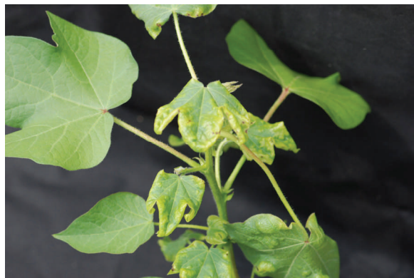
Fig. 16. Blistering and yellowing of young leaves.