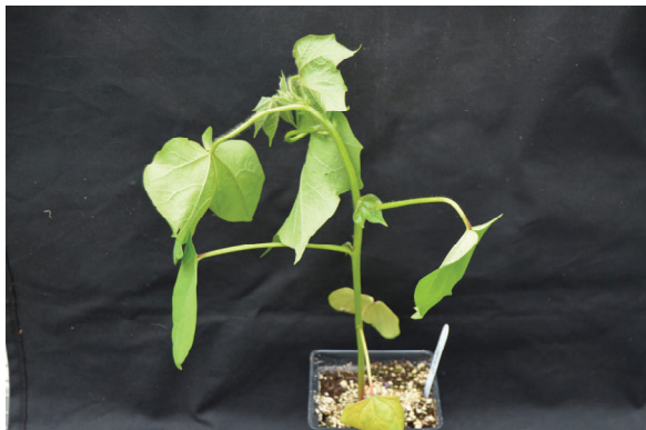
Fig. 19. Petioles drooping and stem bending.