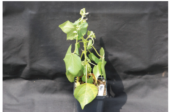
Fig. 3. Early sign of chlorosis.