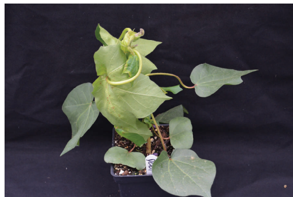
Fig. 27. Severe curvature of petioles.

Overall, symptoms develop quickly in plants exposed to dicamba. Generally, petiole twisting is more severe in plants treated with dicamba than with 2,4-D. By two days after treatment, leaf petioles are curved and youngest leaves are curled (Fig. 25). Around one week after treatment, newer leaves are beginning to yellow and blister along the leaf veins (Fig. 26). By 10 days after exposure, petioles are curved severely and often resemble an “S” shape (Fig. 27). Later, the newest buds are brown (Fig. 28) and the base of the stem has ruptured (Fig. 29). By one month after exposure, older leaves are highly chlorotic and the meristem has been aborted (Fig. 30).