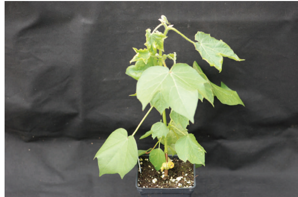
Fig. 10. Blistering and cupping of younger leaves.