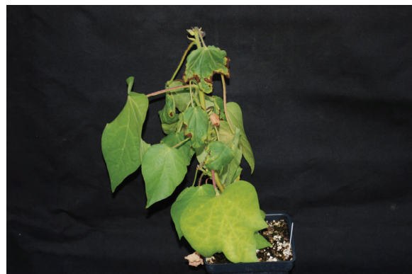
Fig. 18. Meristem abortion and leaf chlorosis.