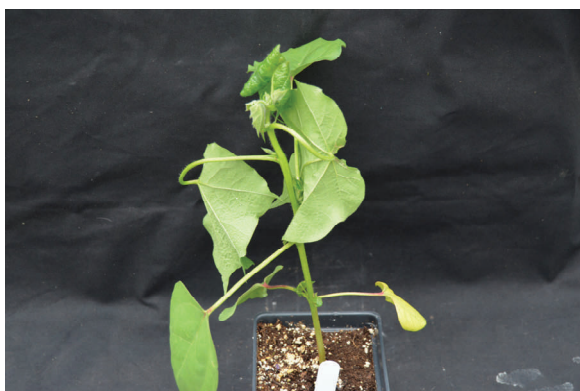
Fig. 25. Petiole curving and leaf curling.