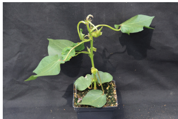
Fig. 28. Browning of newest buds.