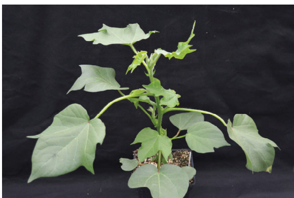
Fig. 13. Petioles drooping and young leaves curling upwards.

Symptoms from exposure to aminopyralid are similar to aminocyclopyrachlor and do not develop as rapidly as with picloram. Initially, petioles droop to horizontal around three days after treatment (Fig. 13). The main stem is bent and blisters appear near leaf margins around one week after exposure (Fig. 14). Later, petiole epinasty is more pronounced (Fig. 15) and new leaves are yellow, blistered and have reduced lateral expansion (Fig. 16). At low rates, older leaves are still upright, but younger leaves are yellow and blistered (Fig. 17). By six weeks after treatment, older leaves are yellow, younger leaves are browning near the margins, and the apical meristem is aborted (Fig. 18).