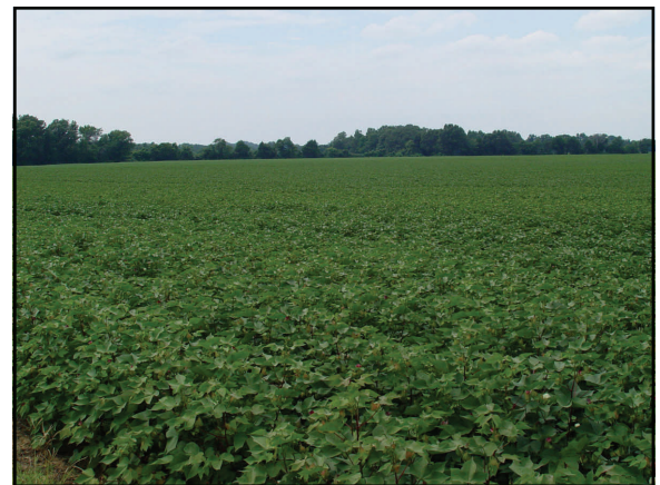
A healthy crop of cotton.

Following proper stewardship recommendations can reduce the impact of off-target herbicides in cotton (see UT Extension fact sheet W 291-A Preventing Off-target Herbicide Problems in Cotton Fields). However, these unfortunate events sometimes occur and diagnosing problems in the field is difficult. Many pasture herbicides mimic the plant hormone auxin, and symptoms can be quite similar. Images and descriptions in this publication are intended to highlight characteristic symptomatology of each of these broadleaf herbicides on cotton.