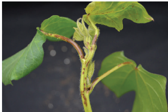
Fig. 21. Reddening of stem and petioles.

Symptoms begin to appear sooner with 2,4-D than with aminocyclopyrachlor, aminopyralid, and picloram. By two days after exposure, leaf petioles are horizontal and the upper stem is bent (Fig. 19). By four days, petioles are twisting and new leaves are curled downwards at the margins (Fig. 20). Later, red to dark brown patches begin to appear on the stem and petioles (Fig. 21). Lower rates cause new leaves to cup upwards and blister at two weeks after exposure (Fig. 22). At one month after exposure, new leaves have parallel venation and lobes have been reduced to finger-like projections (Fig. 23). These young leaves are bent where the base of the leaf meets the petiole and resemble a piece of worn leather. Chlorosis, strapping and reddening of petioles are more severe at six weeks after exposure (Fig. 24).