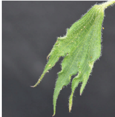
Fig. 23. Parallel venation and strapping.