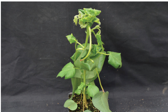
Fig. 2. Severe petiole epinasty and curling of leaf margins.