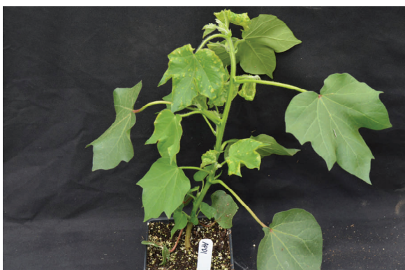
Fig. 14. Blistering near leaf margins.