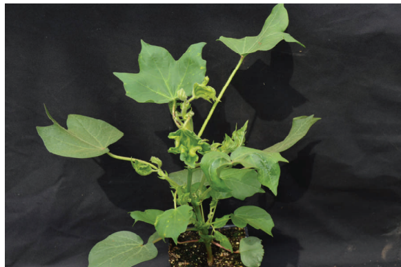
Fig. 22. Upward cupping and swelling of new leaves with low rate.